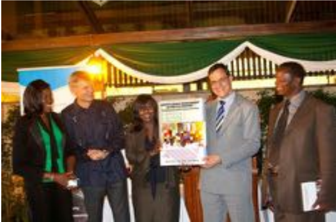
The executive director, ACTS, and the director, DTIA at the launch of the book: Kenya's Urban Development in the 21 st Century: the Call for Innovative Initiatives from Local Authorities

category of people from all over Africa and the world. The outreach team also distributed several other publications at the Climate Change Expo at KICC between 13 th -15 th October 2011. Other staff members also participated in dissemination whenever they attended local and international meetings.